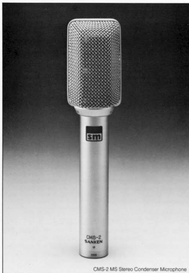
CMS-2 MS Stereo Condenser Microphone